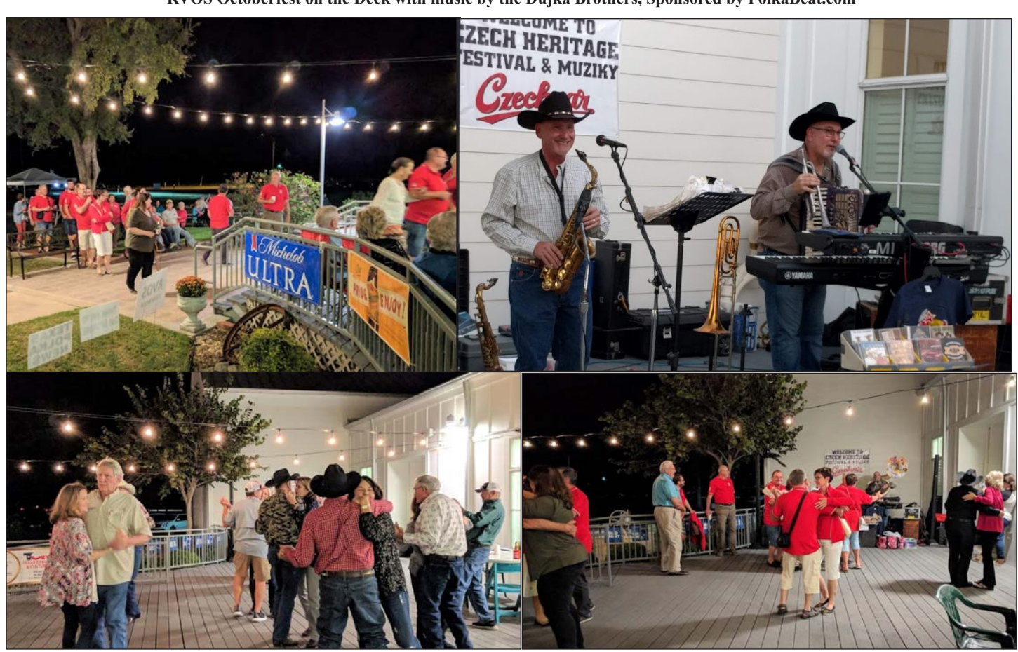
HERITAGE FEST AND MUZIKY JOIN US ANNUALLY ON THE THIRD WEEKEND OF OCTOBER.