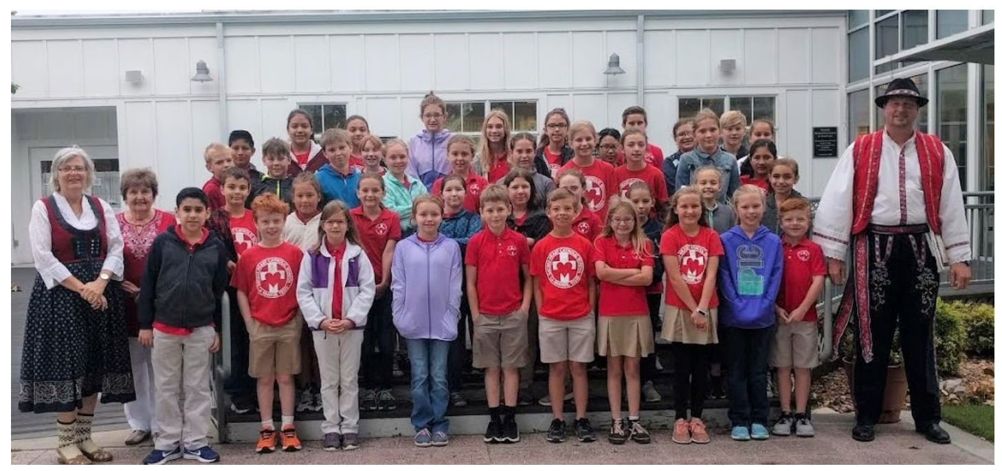
The third through fifth grade students from Sacred Heart School, La Grange toured TCHCC on May 10, 2019. The students were treated to lunch, activities and tours of the Center and the village buildings.