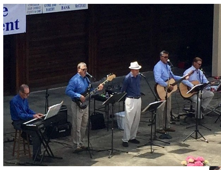
Top and Right: Easter performance by D'Vine Testament on Sunday, April 7 at the Amphitheater.