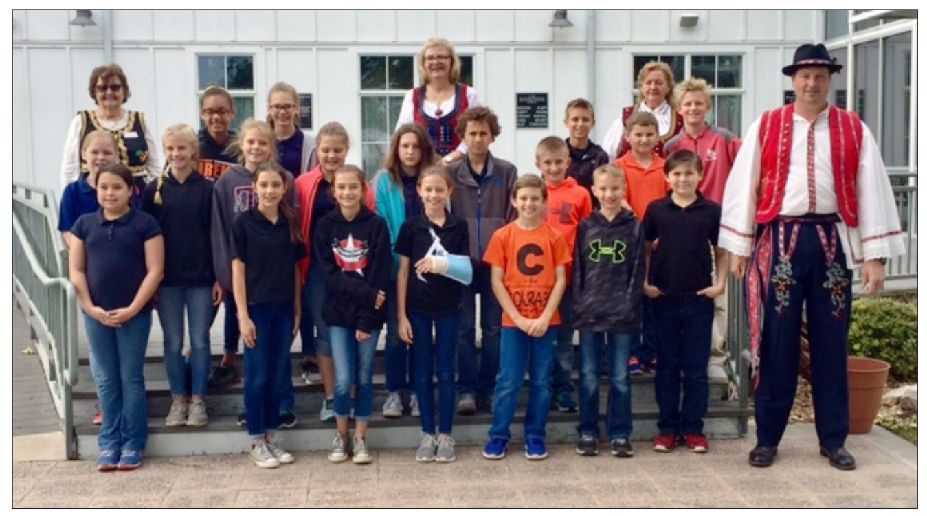
St. Anthony's Catholic School, Columbus