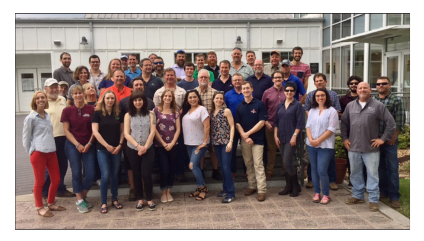
LJA Engineering of Houston and Austin held their "Meeting In The Middle" Picnic at TCHCC in May. The day was a way for the two separate offices to get to know each other.