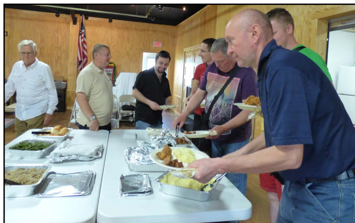
Bottom right: The band enjoyed a lunch catered by Oakridge Smokehouse at the TPLM Msgr. Joe Hybner Center.