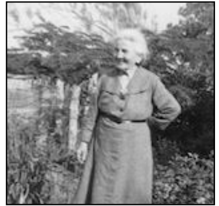
Grandma in her garden, age 82

I also was taught to milk a cow. Not my favorite activity as the cows were big, the udders slippery and I didn't like the feel. You really had to pull hard making sure the milk hit the bucket. I would go with Grandma to herd the cattle into the pen. That was fun as you just walked the pasture shaking a stick calling "hooey" until they wandered into their enclosure.