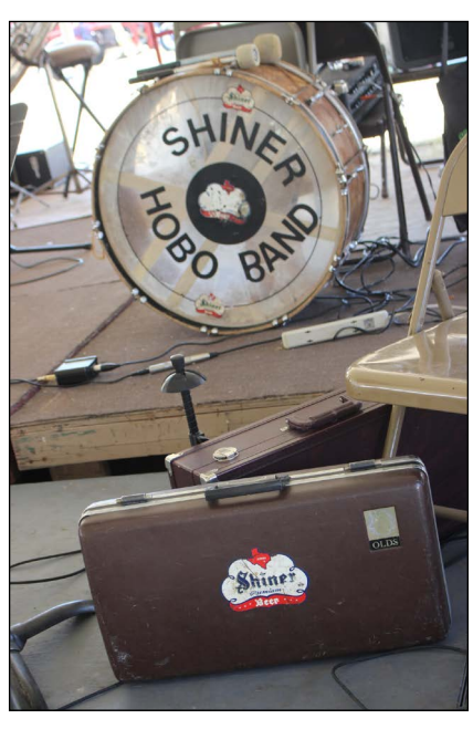
Heritage Fest Pictures